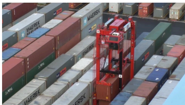
a.g.v. – t.e.u. (Filmstill), Olaf Sobczak, DE 2007